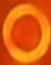
at Annular Eclipse on October 14, 2023 in Mathis, Texas

119 E. Main Street - Hardy - 870-856-3210