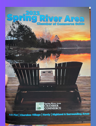
2022 Photo Contest Winner by Tom Helfert (Cover of 2023 SRACC Guide)