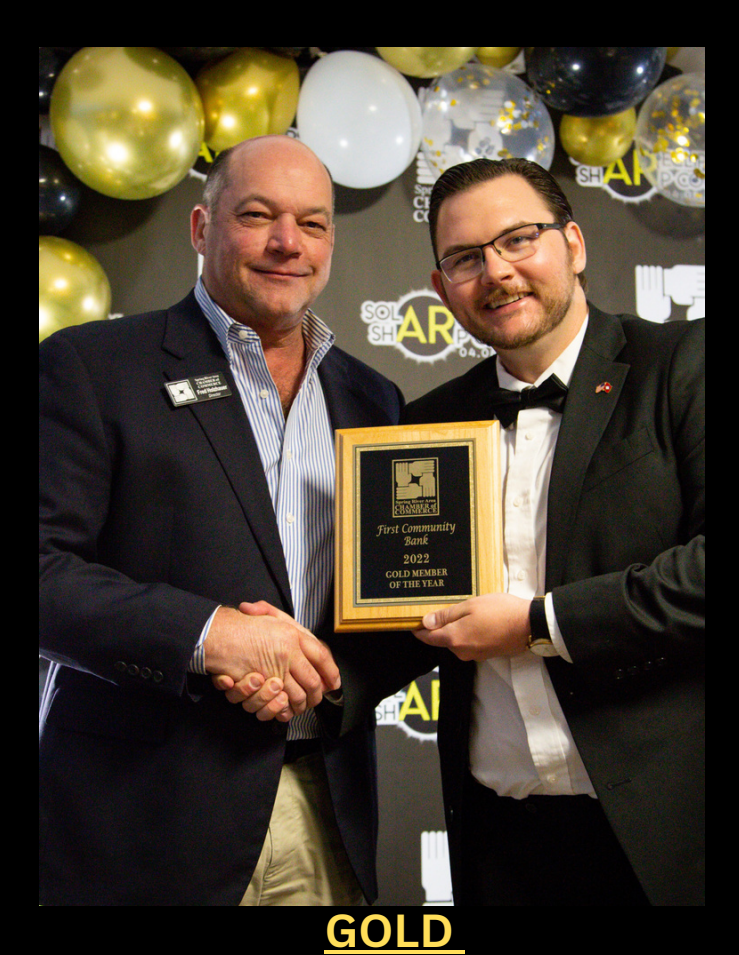
MEMBER OF THE YEAR