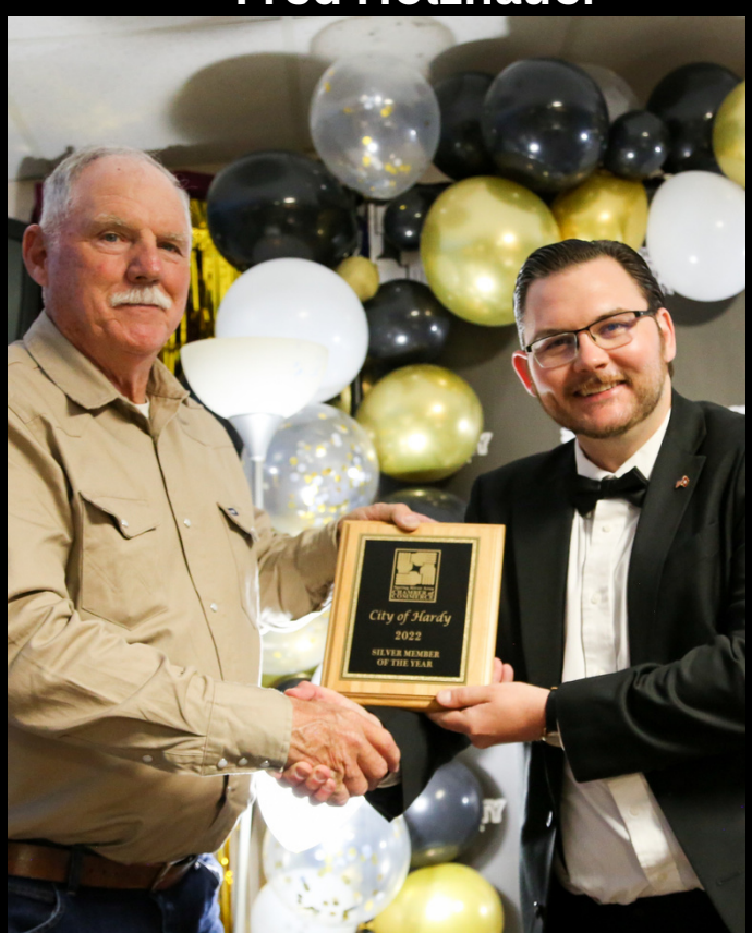
SILVER MEMBER OF THE YEAR